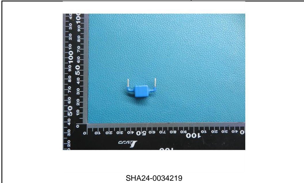
Photo of Submitted Sample

SGS authenticate the photo on original report only